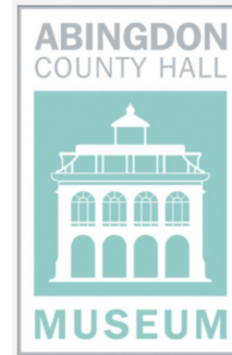
Purchased December 2009 by the Friends of Abingdon Museum and given to Abingdon Museum.