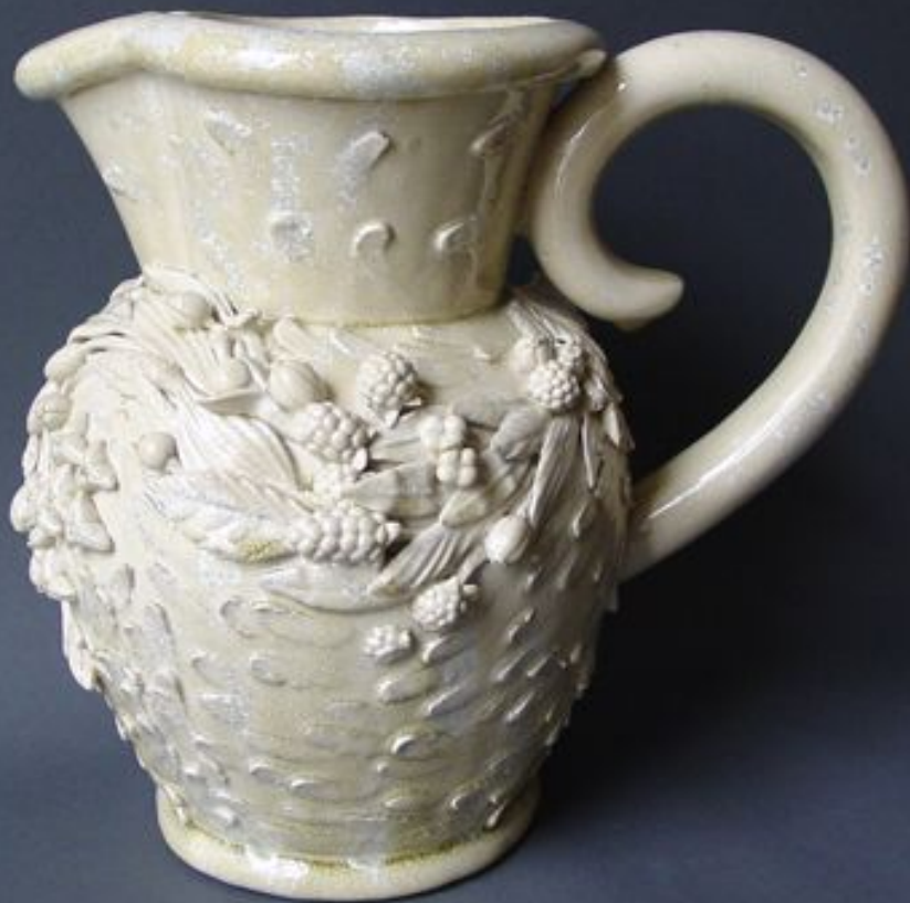
Purchased by the 12th Duke of Devonshire Devonshire Collections, Chatsworth