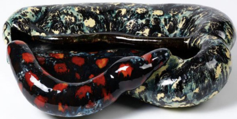
Monster Lily Leaf c.1986–87 earthenware, hand-built, with coloured glazes