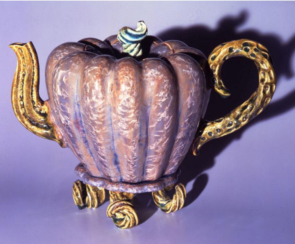
Cinderella's Carriage Teapot 1996 crystalline-glazed stoneware

Image courtesy of British Council British Council