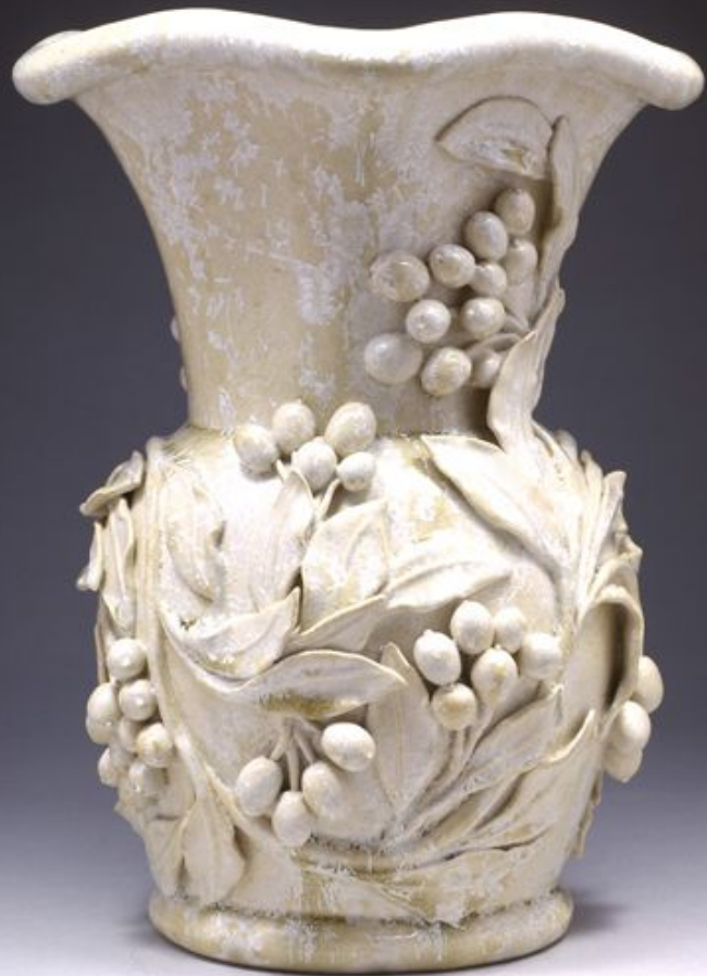
Purchased by the 12th Duke of Devonshire Devonshire Collections, Chatsworth